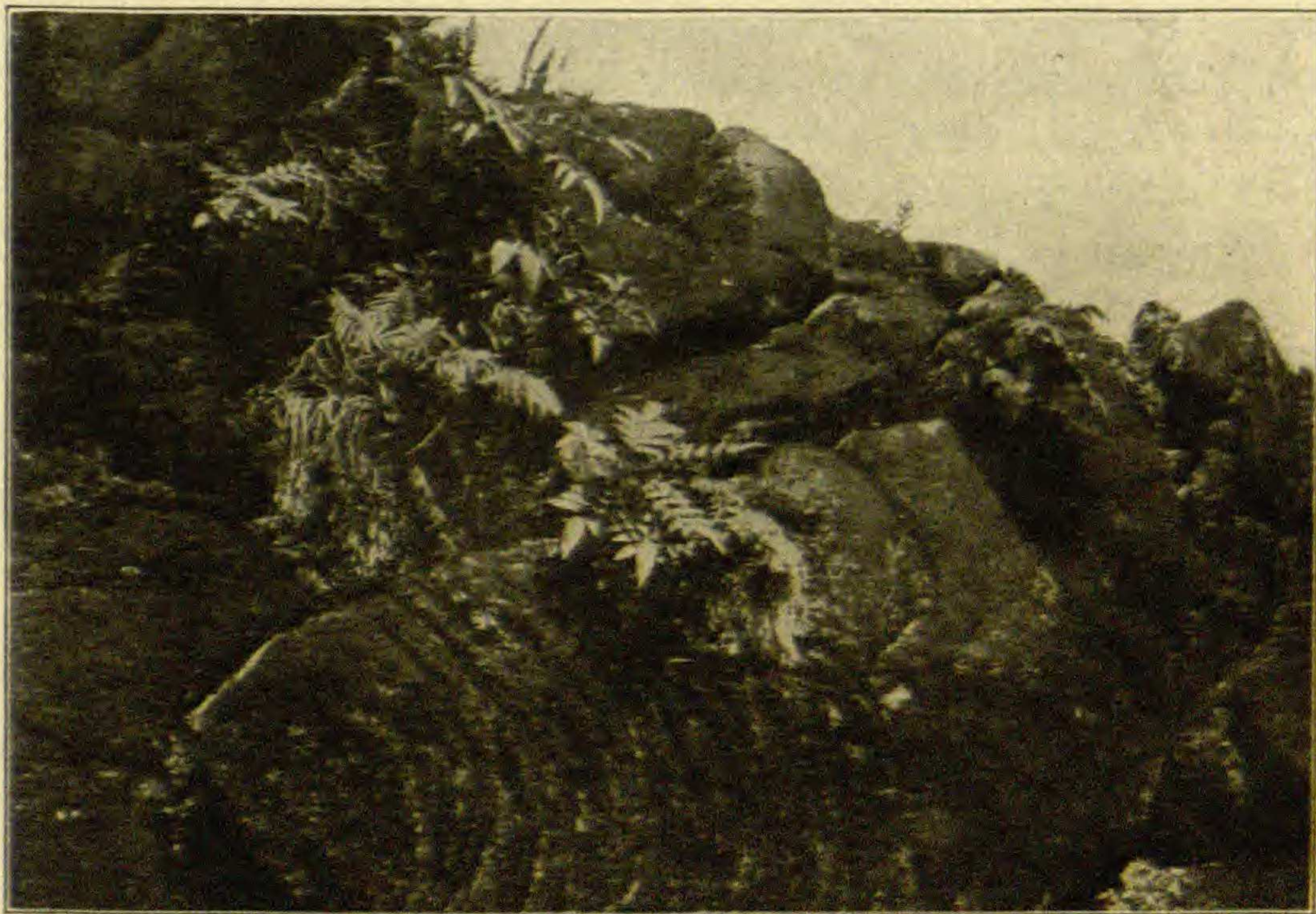
FIG. 5.—Lava flow of the smooth or "pa-hoe-hoe" type; shows invasion by lichens and ferns; in arid situations lava flows retain a new, fresh appearance for a long period of years; under humid conditions they rapidly disintegrate and are soon covered with plant life.

The liliaceous plants of Hawaii are in part woody species; none are bulbs, and none have particularly showy flowers. Of the